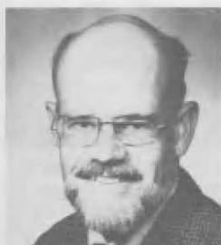
Richard S. Westfall