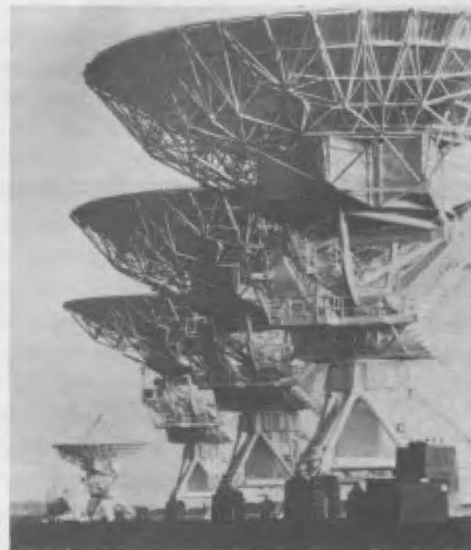
Very Large Array telescopes in New Mexico, 1980 (courtesy of Physics Today).