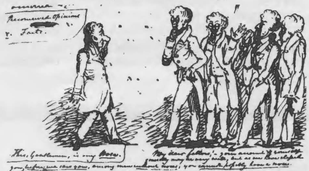
From The Great Devonian Controversy

Response: Martin Rudwick (Princeton University)